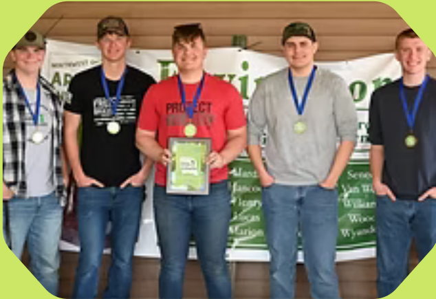
Ft. Jennings High School Team 1