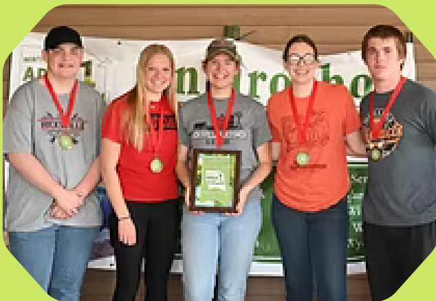
Hicksville High School Team 1